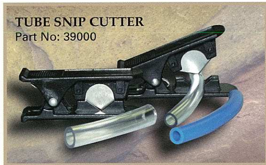
TUBE SNIP CUTTER Part No: 39000

†Items stocked in 100 ft. lengths. Product samples are available upon request.