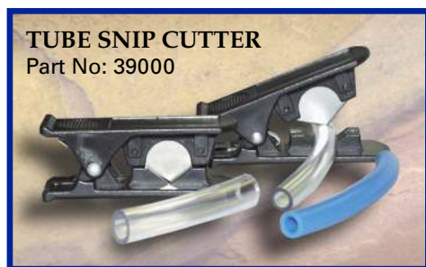
TUBE SNIP CUTTER Part No: 39000

Product samples are available upon request.